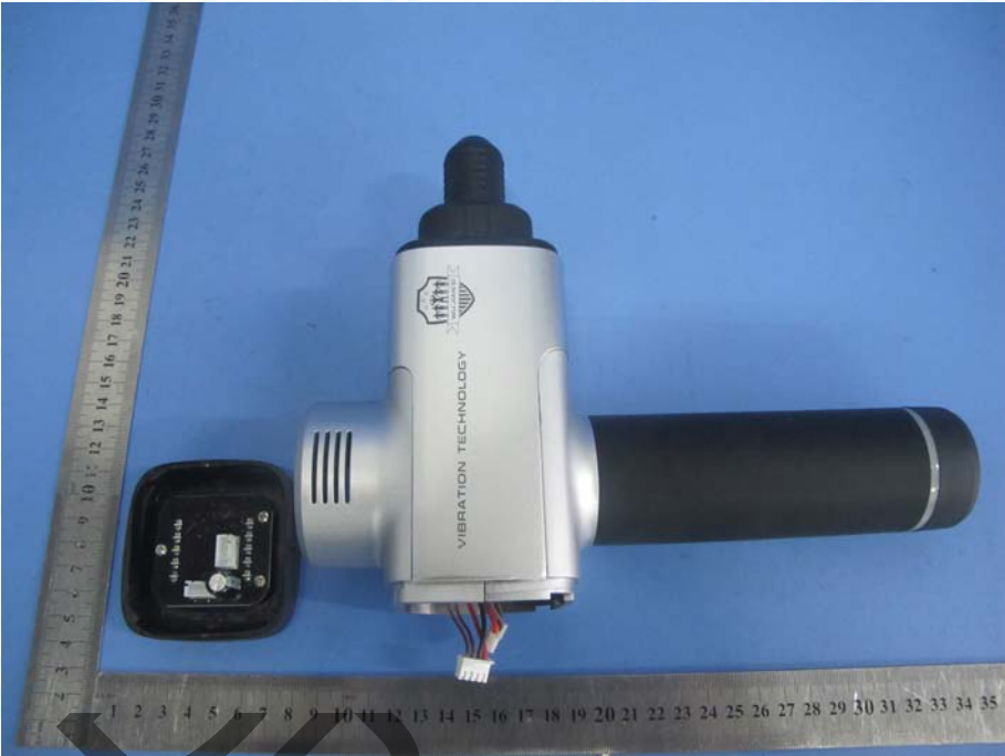
Photo 6 Internal view of EUT