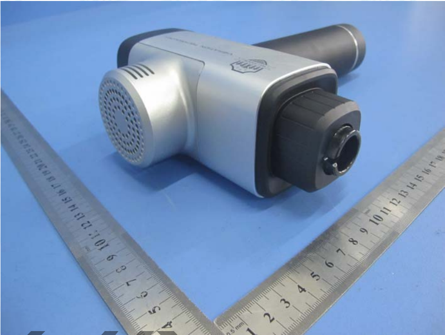
Photo 4 View of EUT