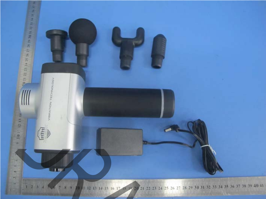
Photo 2 View of EUT